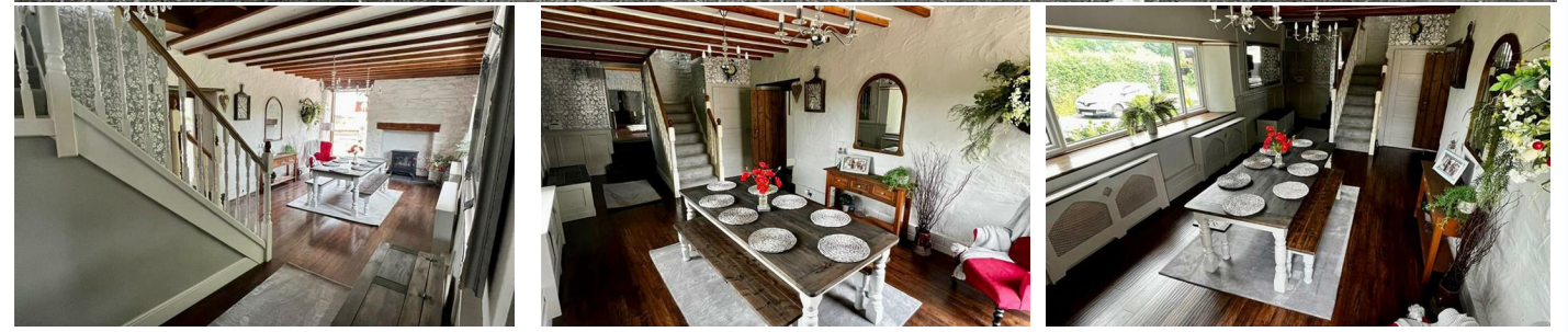
Coming Soon Pembrokeshire, SA61 2LP